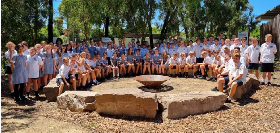
2024 Year 7s first day!