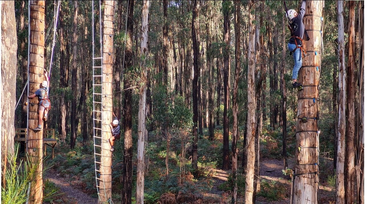
Yr 11 Adventure Camp