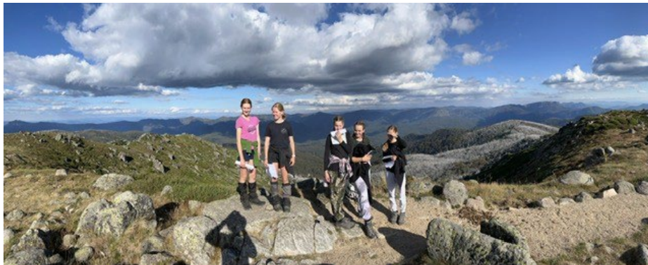
Year 9-10 Adventure Challenge