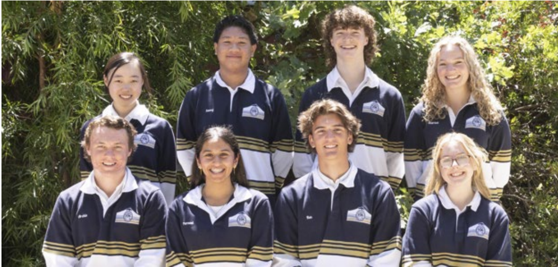
MSC 2023 School Captains & Prefects

Student Leadership: Positions of responsibility and leadership for students at Mansfield Secondary College include College Captains, Prefects and the Student Action Team (SAT).