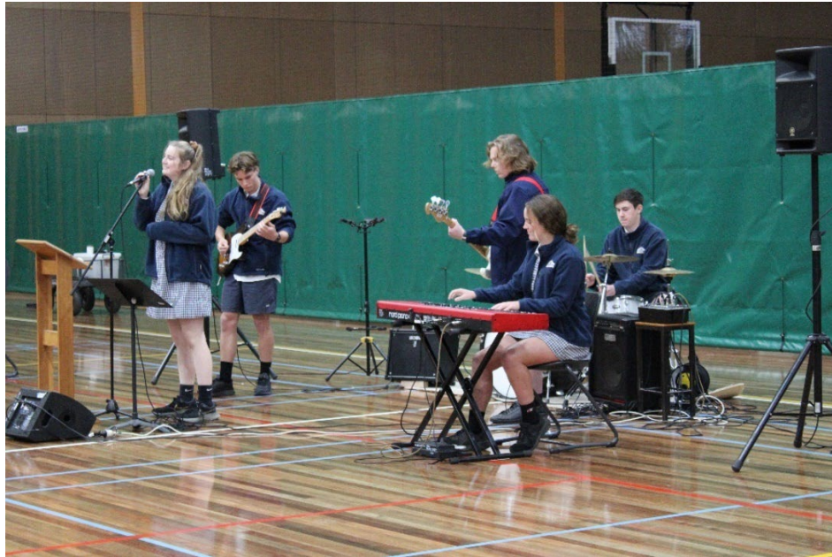
Students performing at School Assembly

Drama and Music: Students participate in a variety of class and practical performance tasks, which are aimed at giving them an understanding of Drama and Music but also to instil confidence and participation in the individual and encourage cooperative group-work practices. They also learn how to reflect and constructively evaluate their work and that of others. In addition to class participation the program offers opportunities to participate in performances at local and community events.