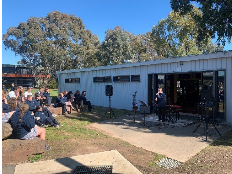
Rock on the Rocks lunchtime performance