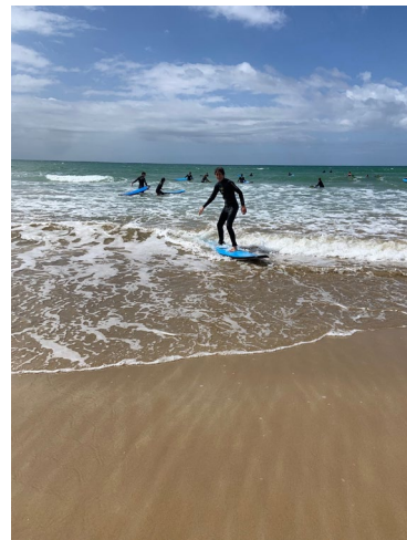
Year 8 Surf Camp