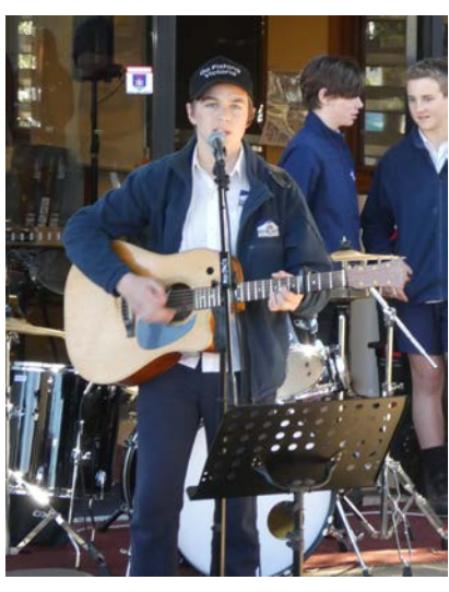
Small Town Gods performing at Rock on the Rocks!