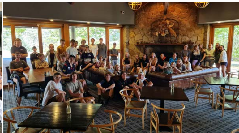
2023 Year 7s first day of secondary school & Year 12s first day of their last year!